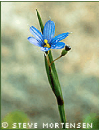
Blue-eyed grass ( Sisyrinchium spp.) Blue-eyed grass photograph Information: Foster, 199 and Tekiela, 9

Light green, delicate members of the Iris Family up to about a foot tall with grass-like leaves. Star-like flowers about 1/2 inch wide with blue tepals (petals and sepals that look alike) and a yellow center. Fruit is a small, round capsule. Several species found in prairies. Blooms in May-June.