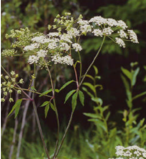
Water Hemlock ( Cicuta maculata ) Information: Foster, 70-71, Tekiela, 293

Large perennial grows 3-6' tall in sunny, wet ditches and wet meadows. Flowers are white flat clusters that bloom in summer and fall. Leaves are compound with lower leaves being larger than upper leaves.