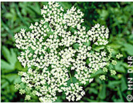
Cow parsnip ( Heracleum lanatum ) Cow parsnip photograph; © MN DNR, G. N. Rysgaard Cow parsnip photograph; © MN DNR, G. N. Rysgaard Information: Foster, 71-72, Tekiela, 305

Water Hemlock is a member of the Carrot family, its long taproot smells and tastes like carrot. HOWEVER, this is the MOST POISONOUS PLANT IN MINNESOTA- just a SMALL amount will cause DEATH