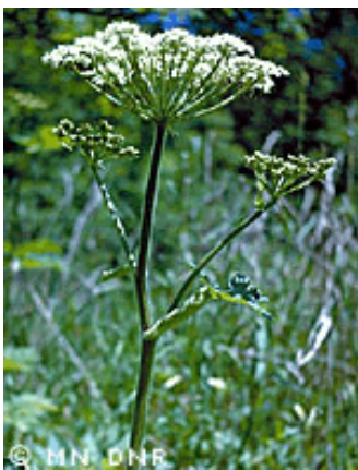
Medicinal: Leaves are poisonous to livestock. The sap of this causes blisters on contact. DO NOT TOUCH! (Foster, 72)

Large coarse perennial grows 3-7' tall in moist, disturbed ground along streams and ditches. White flowers bloom in August and grow in “umbels” or flat-topped clusters. Leaves are woolly underneath