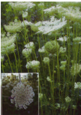
Queen Anne's Lace ( Daucus carota) Information: Tekiela, 297

Medicinal: The root is used medicinally by American Indians. Leaf tea used for fevers, colds and coughs. The tea induces sweating and strengthens a weakened heart.