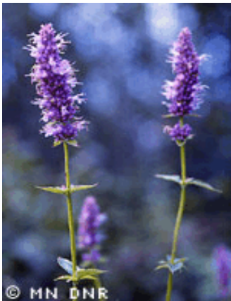
Blue giant hyssop ( Agastache foeniculum ) Blue giant hyssop photograph; ? MN DNR, G. N. Rysgaard Information: Foster, 213-214 and Tekiela, 41

Medicinal: American Indians used the root tea for diarrhea in children: the plant tea was used for worms, stomachaches- some species were used as laxatives.